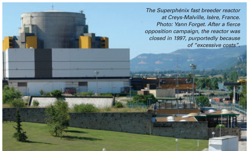
The Superphénix fast breeder reactor at Creys-Malville, Isère, France. After a fierce opposition campaign, the reactor was closed in 1997, purportedly because of “excessive costs”.

“Breeding” in nuclear reactors means the creation of a fissile material in such a way that more fissile material is produced than is consumed for the production of energy. During the fission process, high-energy (fast) neutrons are released. When these fast neutrons hit a “fertile” atom such as 238 U, a new fissile material is created, in this case 239 Pu.